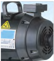
All black treated