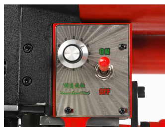
Switch panel (Adjust speed knob)