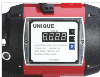
Smart servo electric control