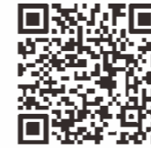
NT8310A-13085-D/J with laser cutter