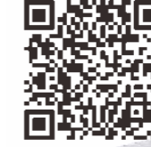
NT8310A-13085-D/QX with blade cutter

Laser cutter for pocket welting, pocket cover edge cutting and collar edge cutting.