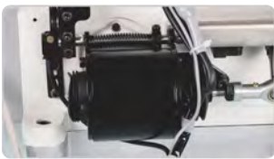
Automatic thread trimmer device