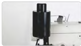
Automatic foot lifter device