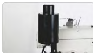
Automatic foot lifter device