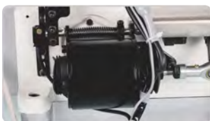
Automatic thread trimmer device