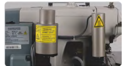
Automatic foot lifter device