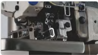
Intelligent fabric thickness sensor