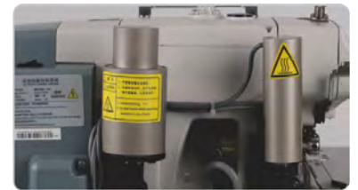
Automatic foot lifter device