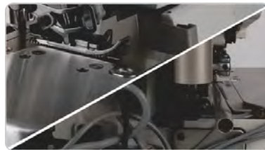
Automatic thread trimmer