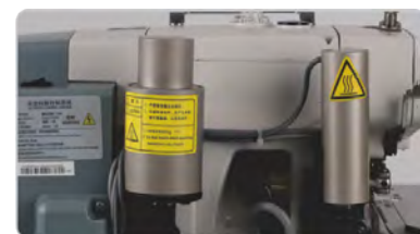
Automatic foot lifter device