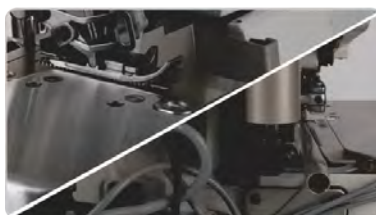
Automatic thread trimmer