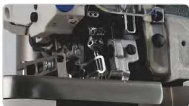
Intelligent fabric thickness sensor